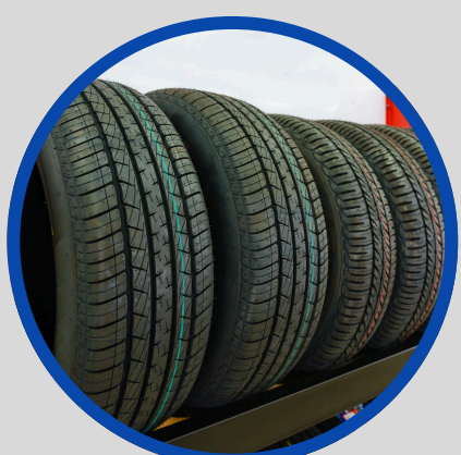
Automotive & Tires