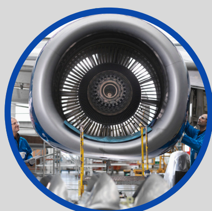
Industrial & Aerospace