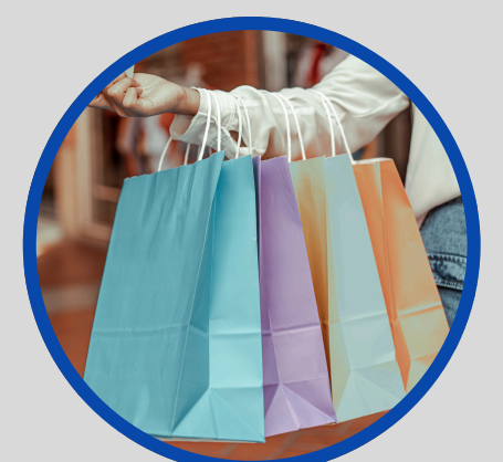
Consumer & Retail